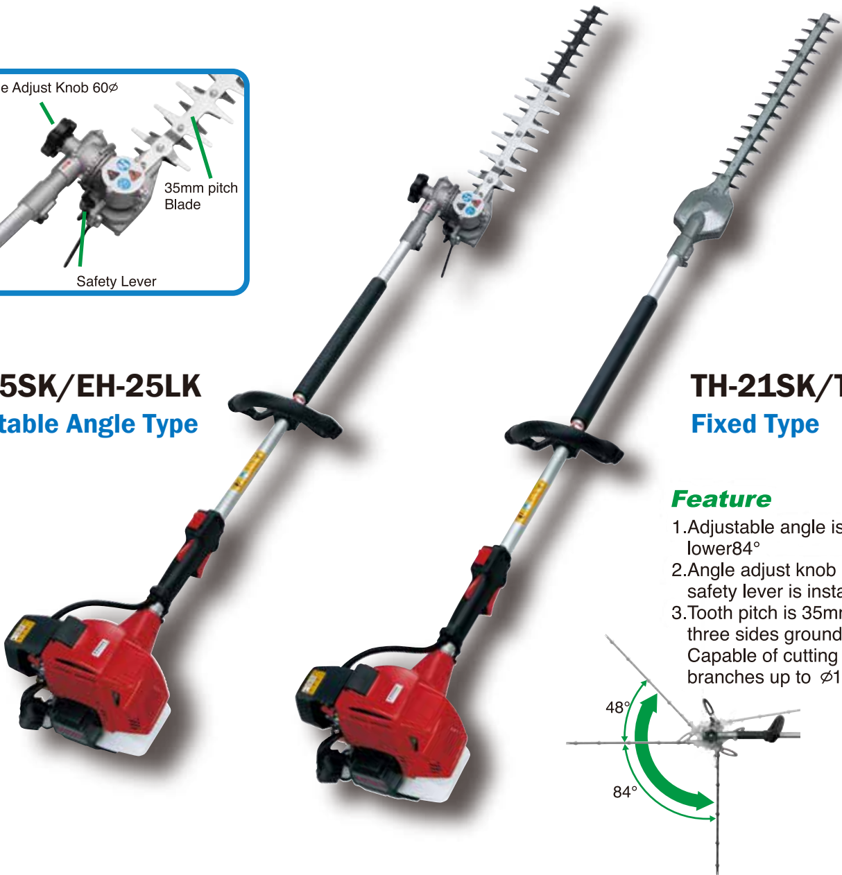
TH-21SK/TH-21LK Fixed Type