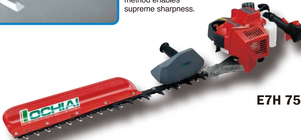
E7H 750/E7H 1000

Tooth Pitch:40mm Refined forging method enables supreme sharpness.