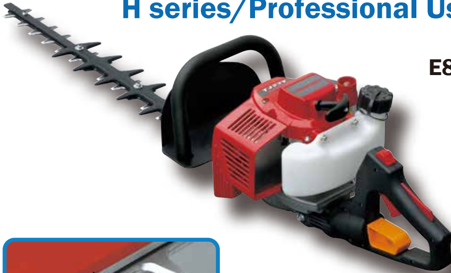
E8H 600/E8H 750