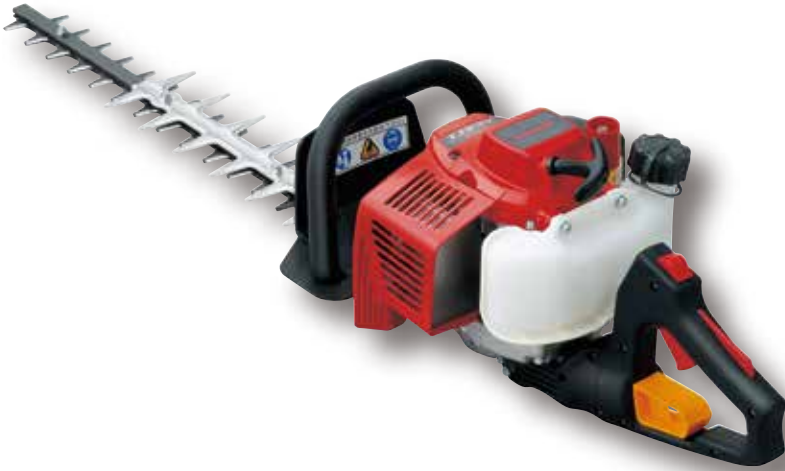
E8G 600/E8G 750