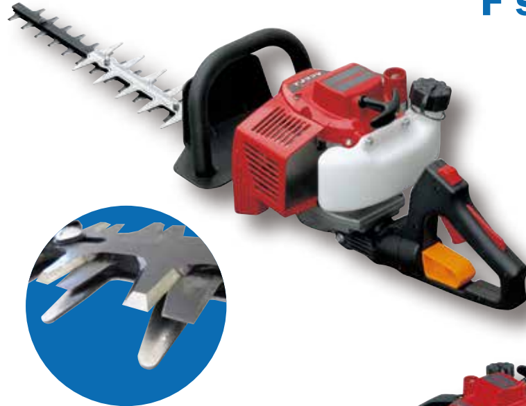
E8F 600/E8F 750